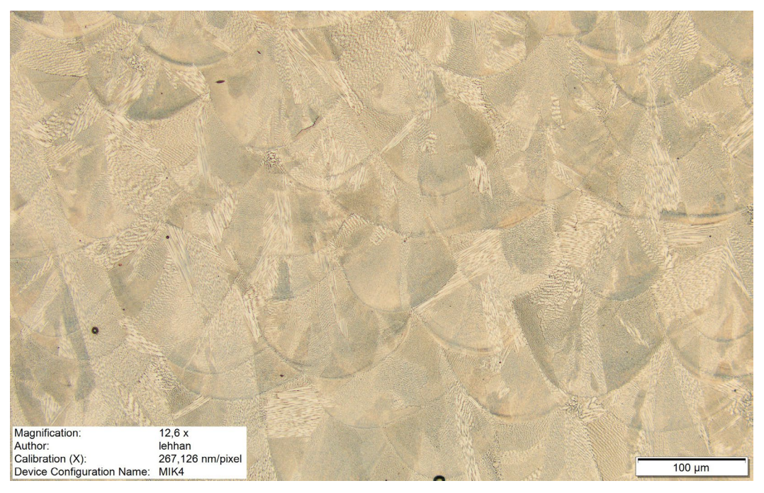
Image 2: Etched EOS K500 as manufactured microstructure etched ASTM E407 recipe 40

"EOS K500 fills an important gap between two worlds of AM materials, the high mechanical strength of nickel-superalloys and the thermal conductivity of copper alloys," said Business Development Manager of EOS Metal Materials, Juha Kotila, M. Sc. "The EOS material development team successfully created EOS K500 as a solution for space applications where both mechanical strength and thermal conductivity are needed at the same time, or in extreme conditions."